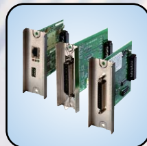
Plug-In Interface Modules