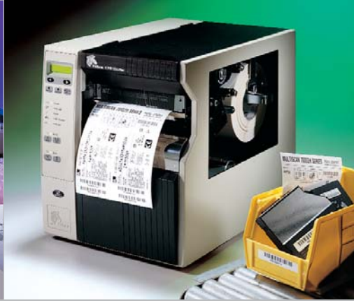
170XiIIIPlus™ 203/300 dpi

Ribbon width: 1.57"/40 mm to 5.1"/130 mm