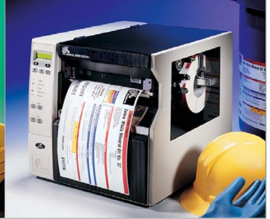
220XiIIIPlus™ 203/300 dpi

In North America, the 170XiIIIPlus has an RFID Ready option that allows you to upgrade to RFID technology in the future.